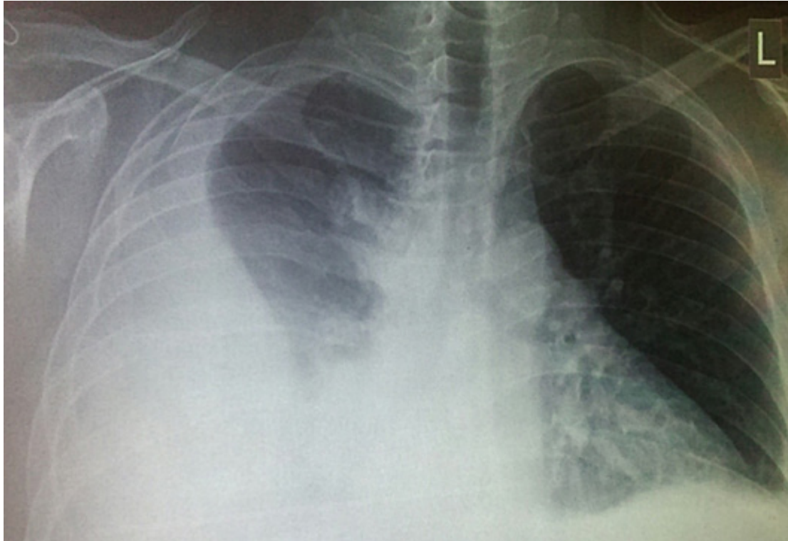
Figure 1: Native lung RTG at the admission