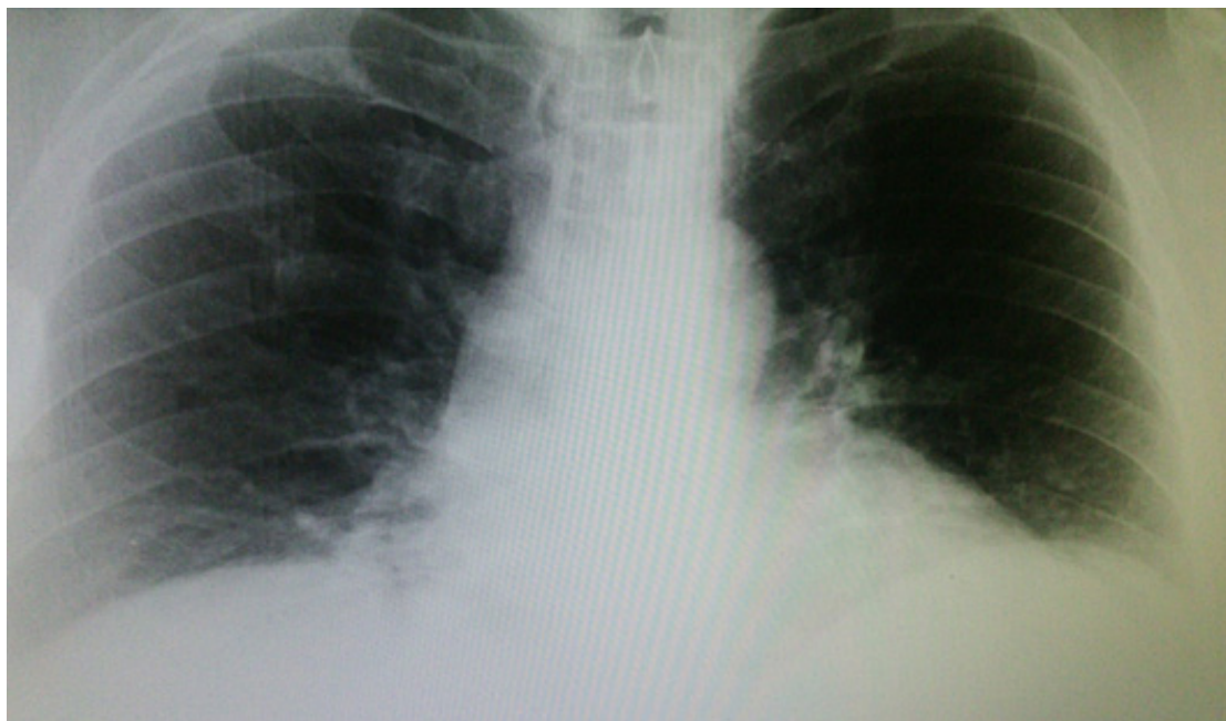
Figure 4: Native lung RTG on one year after surgery

Native lung RTG at the admission of the patient: On right basal and medium parties and in apical para-costal segment there is a homogeneous shadow of a large amount of pleural