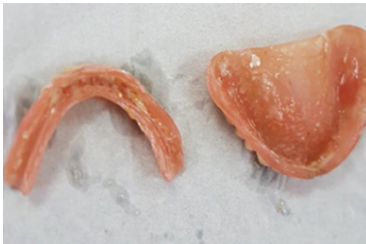
Figure 2. Total prostheses

tures time was 7.8 years ranging in an interval of 3-20 years (Figure No. 2).