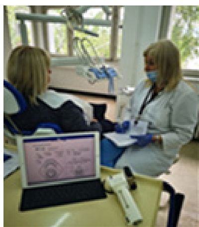
Figure 1. Epidemiological survey and clinical examination

The data for the paper was obtained by clinical and epidemiological examination, observational cross-sectional study conducted in the geriatric population - patients over 65 years of PHI UDCC "St. Panteleimon", Skopje (Picture 1). Eighty respondents who were included in the study signed an informed consent form. The examination was approved by the Ethics Committee for examination at the Faculty of Dentistry, UKIM in Skopje.