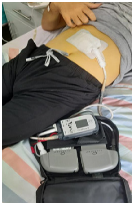
Picture 1. Patient with LVAD