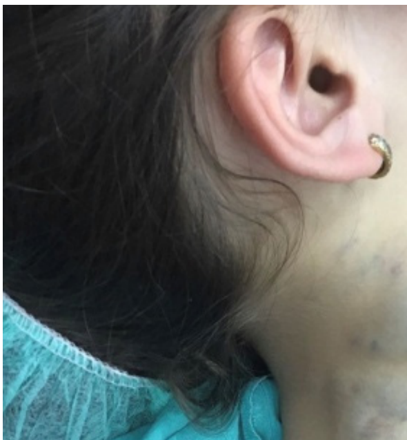
Fig 3. VM on the neck before sclerosing intervention