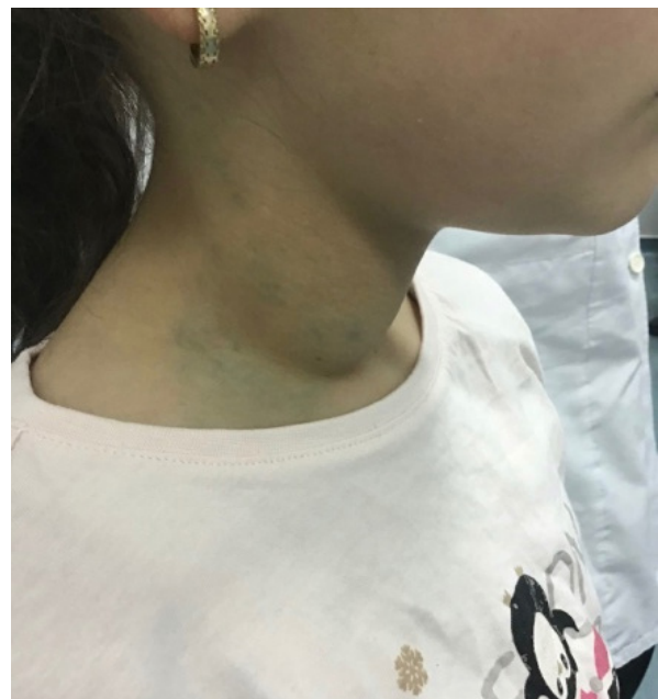
Fig 4. VM after two sessions of sclerotherapy