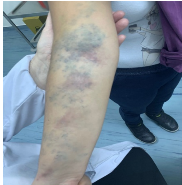
Fig 2. Outcome after one session of sclerotherapy