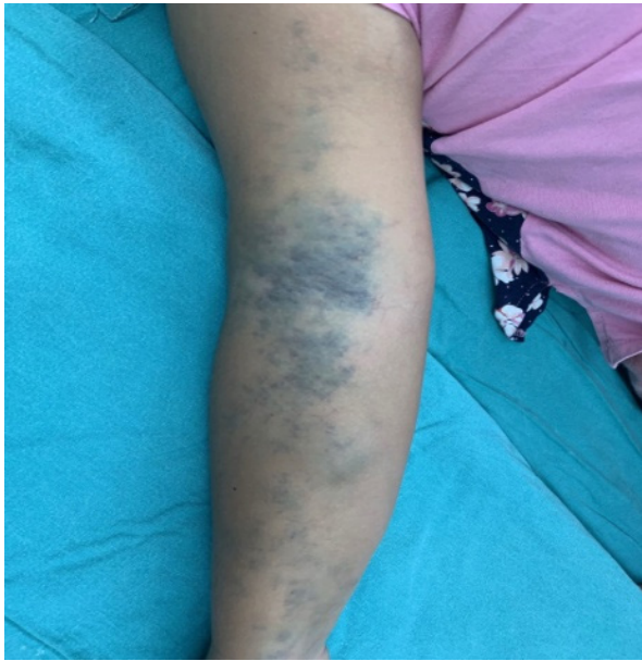
Fig 1. VM on the arm before sclerotherapy

tion on the neck due to an intermittent pain that limited mobility of the neck (Fig.3). The procedure with bleomycin as sclerosing agent was performed in the operative theater under general anesthesia. Follow-up examinations revealed regression of the change not only from functional but from aesthetic aspect as well (Fig.4).